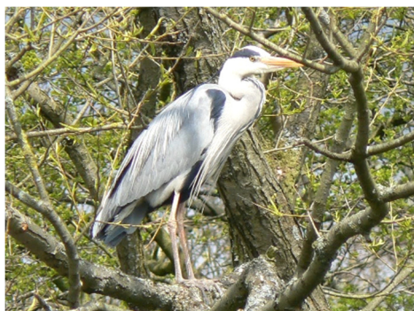
Grey Heron, 16.4.2008.