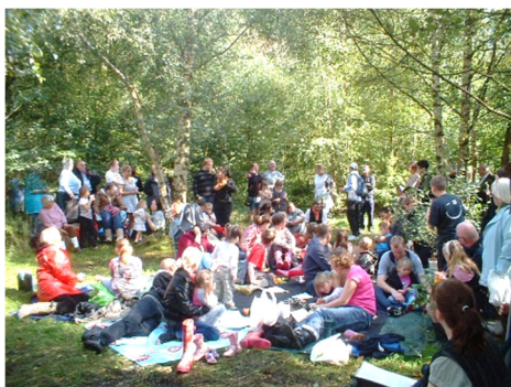
Fairy-tale play, 6.9.2008.