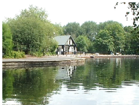
Lakeside Café, 23.6.2009.

The Clough, 190 acres, contains grassland, two lakes & steep sided valleys covered with Ancient Semi-Natural Woodland (ASNW). The government's adviser on the environment describes ASNW as "irreplaceable" (English Nature, 2002) & "of prime ecological & landscape importance" (Natural England, 2014).