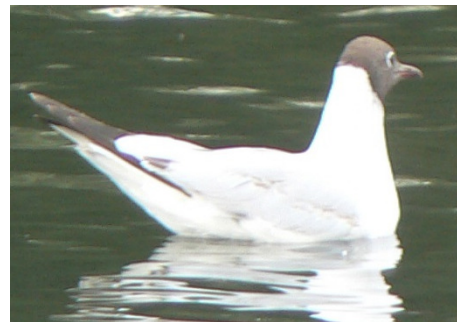
Black Headed Gull