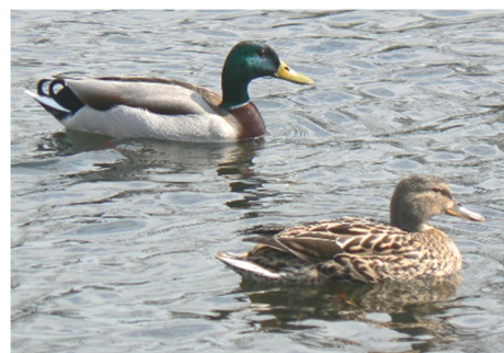
Male & female Mallard, 16.4.2008.