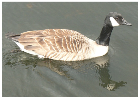
Canada Goose, 16.4.2008.