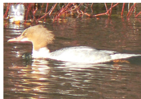
Female Goosander, 13.11.2010.

Every Saturday 10am outside the Lakeside Café.