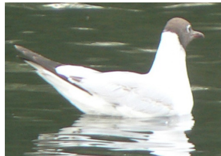
Black-headed Gull, 14.7.2012.