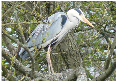
Grey Heron, 16.4.2008.