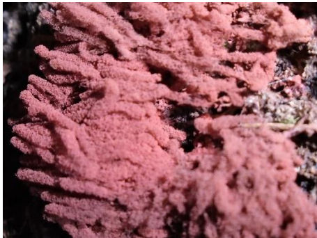
Stemonitis Slime Mold