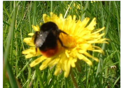
Bumble Bee / Dandelion

Caution: fungi & berries etc shown above may be poisonous.