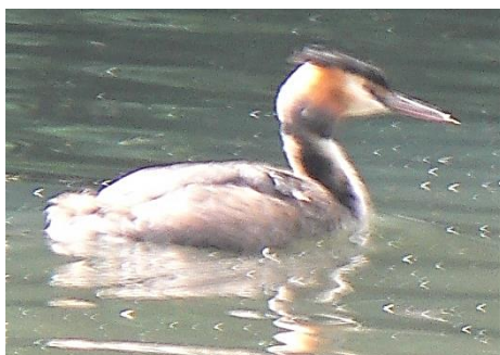
Great Crested Grebe