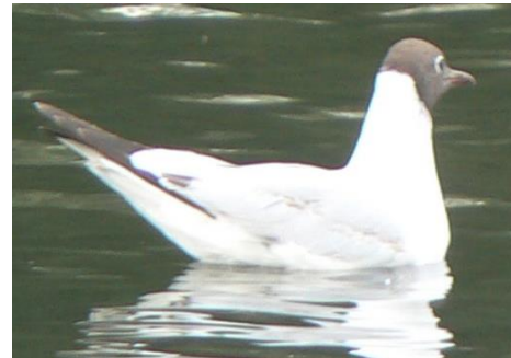
Black Headed Gull